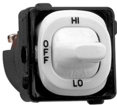
Clipsal 39M Series or similar