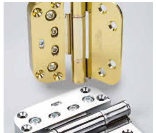
TOP: Loadpro 3D Adjustable Butt Hinges in (left to right) white powder coating, Supercoat 500 and yellow zinc. ABOVE: Polished brass and polished chrome.